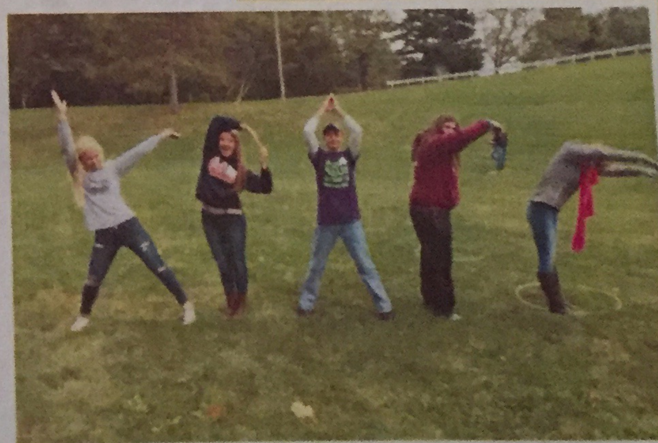
Students at the Fall Picnic make their bodies into the shape of "KDASC".