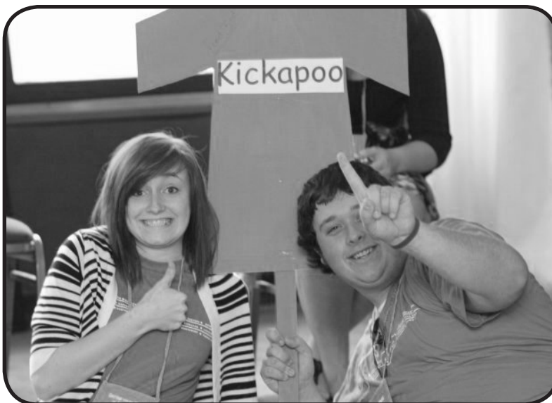
Two council members show their Kickapoo pride at the 76th Annual IASC State Convention. The convention was held in at the Springfield Hilton.