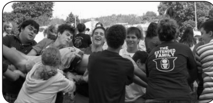
KDASC members play one of the many fun games at last years Fall Picnic. The Fall Picnic this year is hosted by Unity.

The Kickapoo District Association of Student Councils is off to a great start this year. The executive board is working to bring new ideas and increase membership for the district. We are hoping that with your help we can make it a great year with the district. We look forward to seeing you around the rest of the year at all the fun events. Have fun at the Fall Picnic!